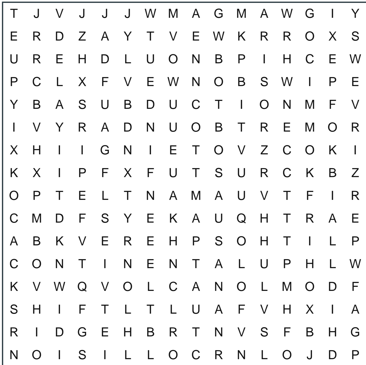
Plate Tectonics Word Search

BOUNDARY COLLISION CONTINENTAL CRUST EARTHQUAKE